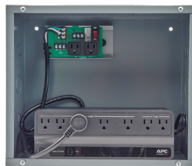
Shown Without Cover