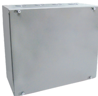
Shown With Cover