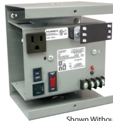
Shown Without Cover