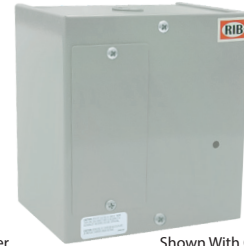
Shown With Cover

* Move internal jumper to "HOT" position if you wish outlets to always be hot otherwise outlets will be switched by main breaker.